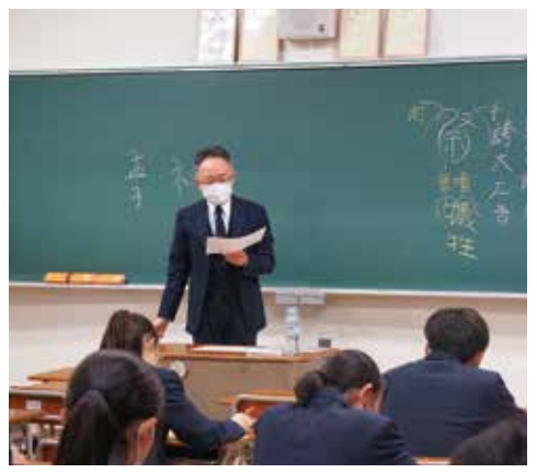
University lecture (2nd year students)